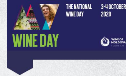
National Wine Day